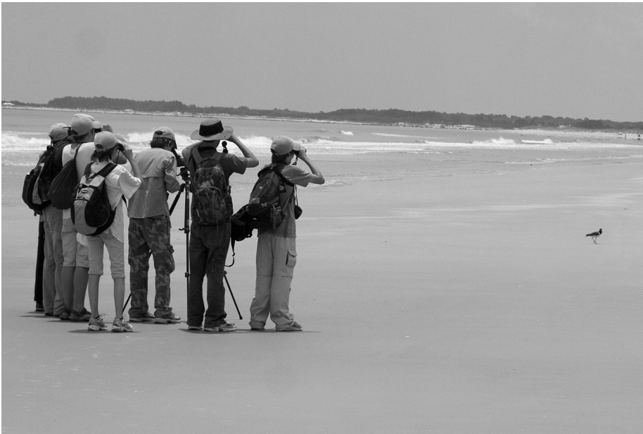
Camp TALON participants on Cumberland Island.

The intense effort of all of the chaperones to organize the best camp within their capabilities certainly paid off, in my opinion. I just hope that the other campers had as much of an exquisite experience as I had. After all, it is not every day that you can hop outside to stumble across such beauties as Roseate Spoonbills, Piping Plovers, and Clapper Rails. Being that I do not want to spoil the surprises for future Camp TALON participants, I am going to keep secret some of the other birds that can be encountered.