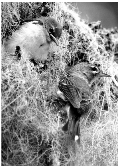
Nesting Northern Parula.

We made several trips to the mainland as well, where not only the birds were amazing but also the insects. I found many species of butterflies that were quite new to me, things that we don’t see in Georgia, such as Silver-bordered Fritillary and Harris’s Checkerspot. The northern marshes were filled with many dragonflies and damselflies that I had never seen, like Sedge Sprite and Frosted Whiteface. These were accompanied by great marsh birds such as Virginia Rail, Nelson’s Sparrow, and Sora.