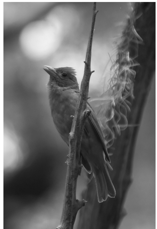
Summer Tanager on Little St. Simons Island.