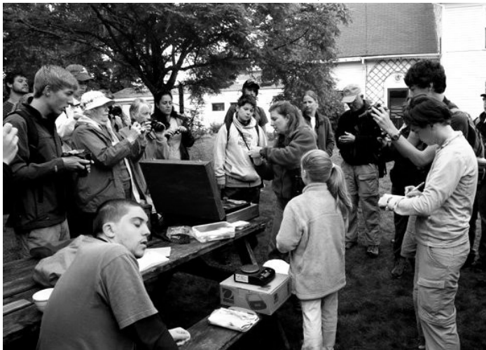
Campers at Hog Island.

Those early-morning hikes certainly weren’t the end of the birding fun. Mornings and afternoons were consumed by various field trips to premier birding locations, both on the mainland and to other islands in Muscongus Bay. One birding location on the mainland was McCurdy Road, where we sighted a Black-and-white Warbler, a Canada Warbler, various other species, and a Northern Waterthrush, which was a life bird for most of the group. The mainland birding expeditions also included a few other marshy tracts of land, such as one preserved by the Damariscotta River Association (DRA), where I got a lifer Black-billed Cuckoo. Mainland birding adventures held the sightings of Broad-winged Hawks, Swamp Sparrows, Lesser Yellowlegs, Alder and Willow Flycatchers, Nelson’s Sparrows and various species of butterflies and dragonflies, as well as the occasionally frog species. Looking for wonderful ornithological creatures far extended beyond the mainland. One morning, the teen group broke up into two groups of eight, the “Stellars” and the “Magpies.” My group, the “Stellars,” did a hike along the trails of Hog Island itself. This was one of my favorite trips, as we hiked along trails that wound their way through fields of Hay-Scented Ferns that were shadowed by the looming red and white spruces. On this hike we saw Black-Throated Green Warblers, Blackburnian Warblers, and a Merlin, which were all life birds