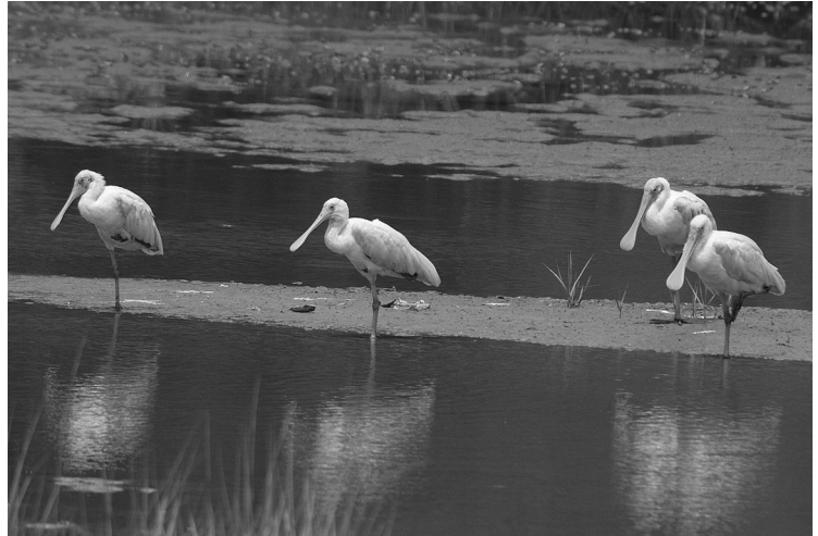
Roseate Spoonbills on Little St. Simons Island.