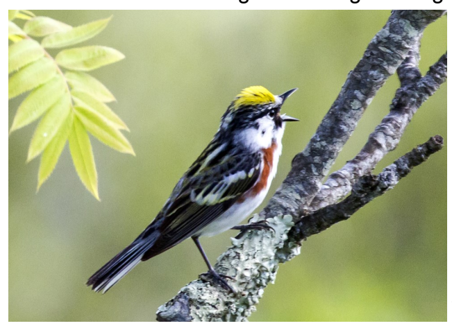
Chestnut-side Warbler at Brasstown Bald.

The great bird sightings started on the drive up, with many birders stopping at Tallulah Gorge to view the first cliff-nesting Peregrine Falcons seen in the state in a very long time. While the ones nesting in downtown Atlanta have successfully nested for years, this site represents the first nest in a wild setting. Not that Atlanta can't be a wild place at times, but I think you get my point. As of this writing, it looks like two young have fledged from the nest. Here's hoping there are future successful nestings for Georgia Peregrine Falcons.