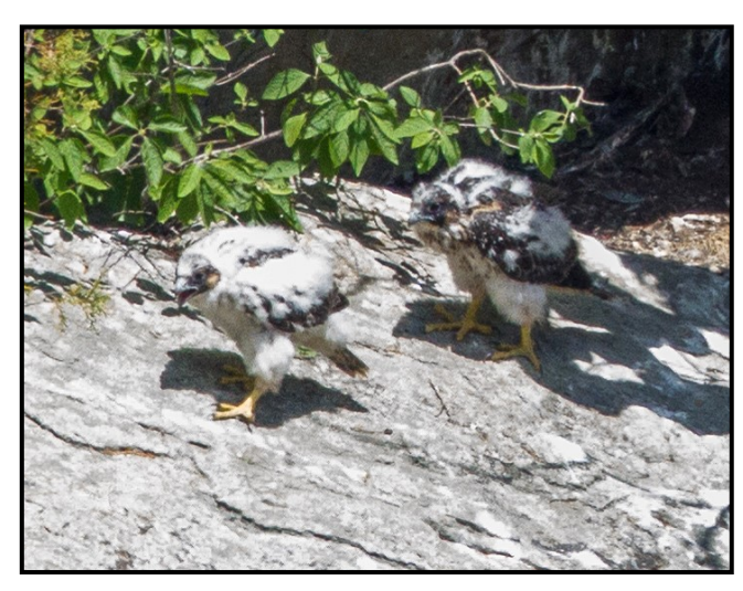
Two Peregrine Falcon chicks at Tallulah Gorge State Park.