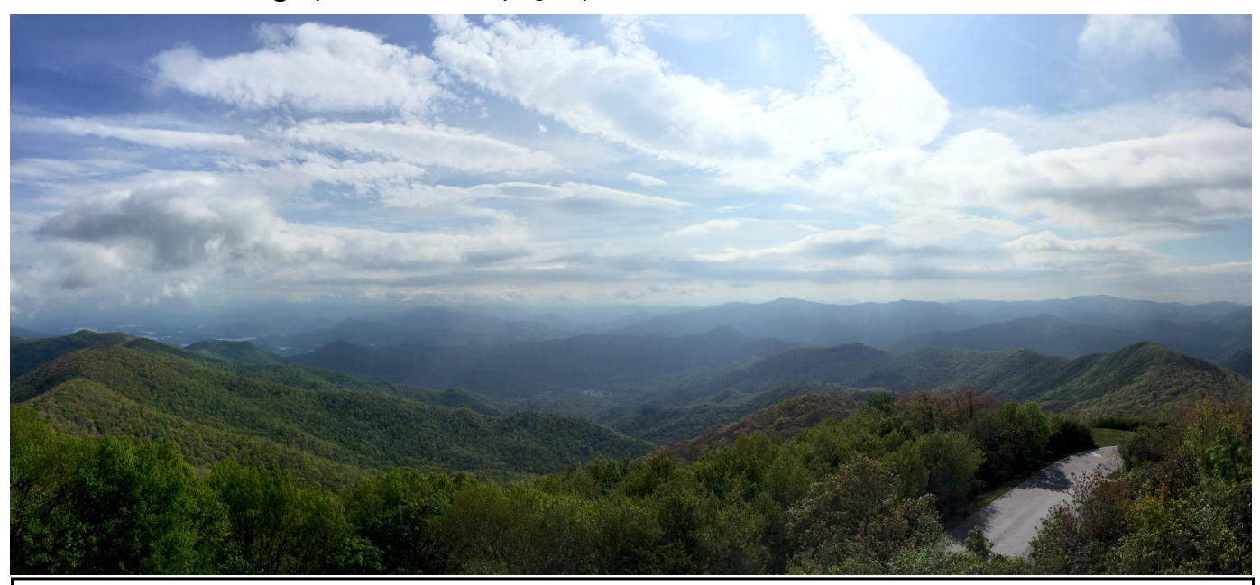
View from Brasstown Bald.

The great bird sightings started on the drive up, with many birders stopping at Tallulah Gorge to view the first cliff-nesting Peregrine Falcons seen in the state in a very long time. While the ones nesting in downtown Atlanta have successfully nested for years, this site represents the first nest in a wild setting. Not that Atlanta can't be a wild place at times, but I think you get my point. As of this writing, it looks like two young have fledged from the nest. Here's hoping there are future successful nestings for Georgia Peregrine Falcons.