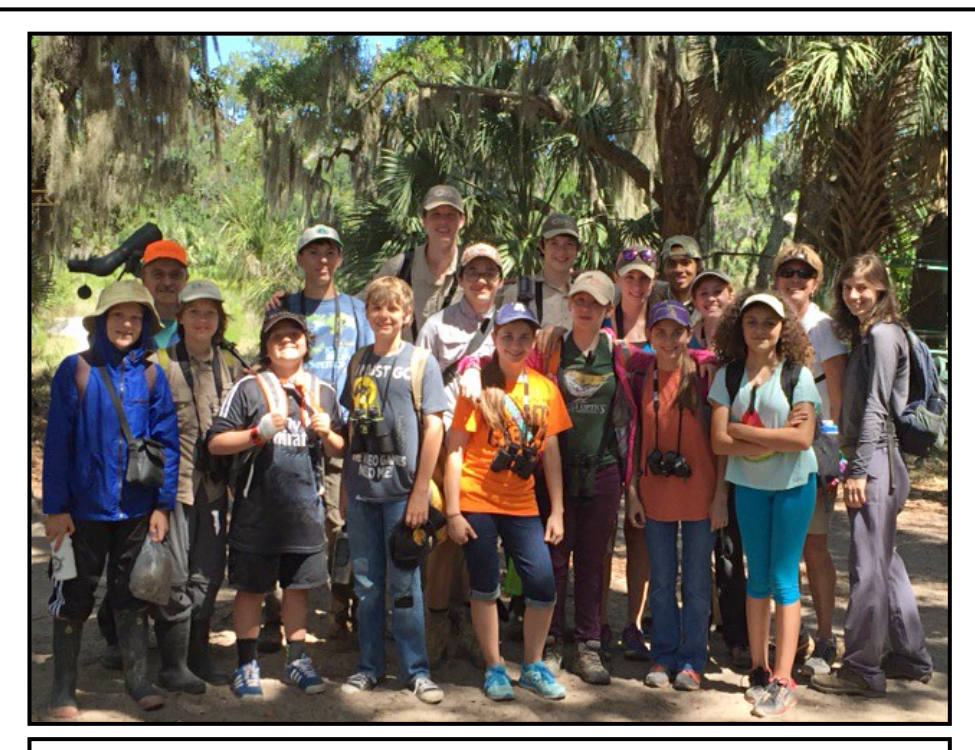
The Camp TALON class of 2015 birds Little St. Simons Island on June 1. Full story to follow in the September 2015 GOShawk issue.