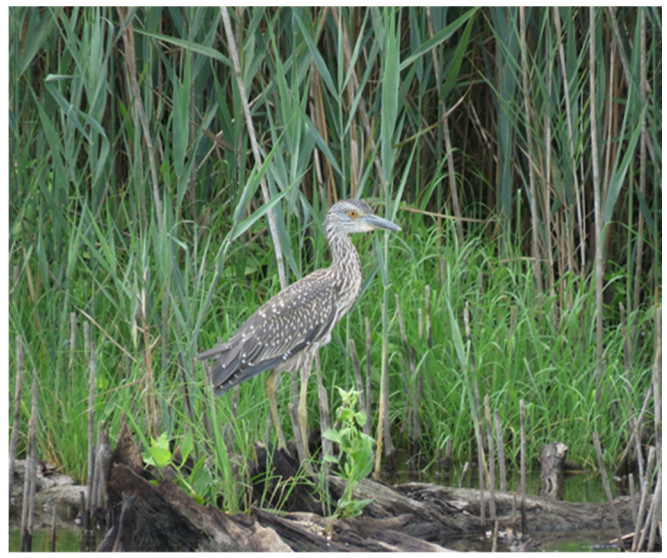
Immature Yellow-crowned Night-heron.

Early Saturday morning, I said goodbye to my family and boarded a plane in Atlanta. After a short flight, I landed in Philadelphia, grabbed my luggage, and got on one of the shuttles with several other campers and headed to the Virden Center, where we would be staying for the week. A couple of hours later, we arrived at the Center, moved into our rooms, and met our roommates. After dinner and a short orientation meeting, we headed to Cape Henlopen State Park, our first birding location of the week, where we had a taste of what was to come.