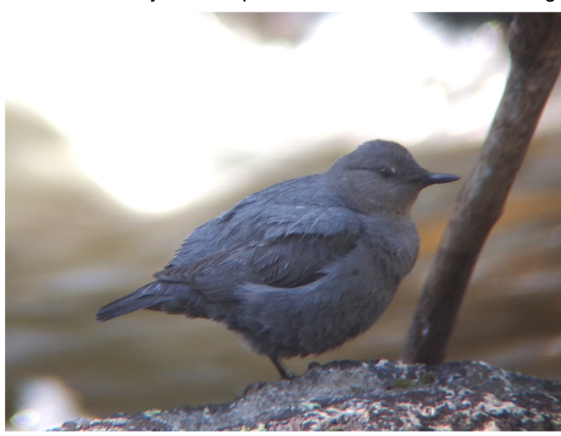
American Dipper by Rich Hull.

The second day of the trip was one of two montane birding days. Our first stop, located within Rocky