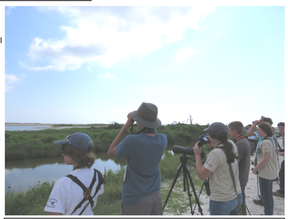
Camp Avocet birders at Chincoteague NWR

I will never forget the amazing experience I had at Camp Avocet. I met many new friends and made many good memories. I am extremely grateful that GOS gave me this amazing opportunity of being able to attend Camp Avocet.