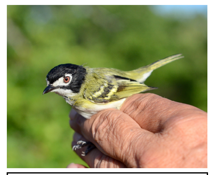
Black-capped Vireo.