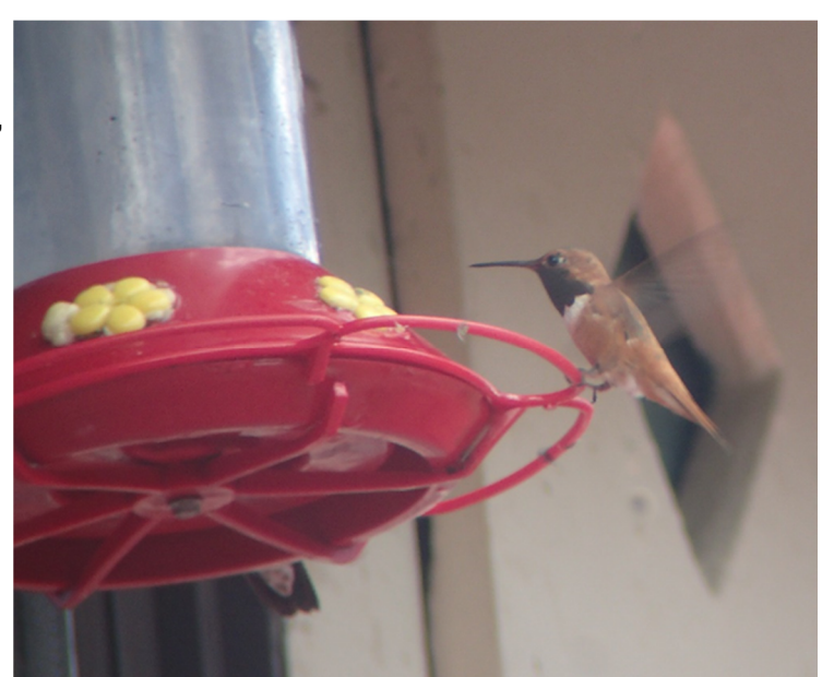
Rufous Hummingbird

On our last full day of Camp Colorado, we drove down into the foothills for some riparian birding. Since I had missed the Dusky Flycatcher at Rocky Mountain National Park, I was relieved to hear my lifer Dusky Flycatcher calling from a stand of dry woods. However, the highlight of the riparian area was a quick,