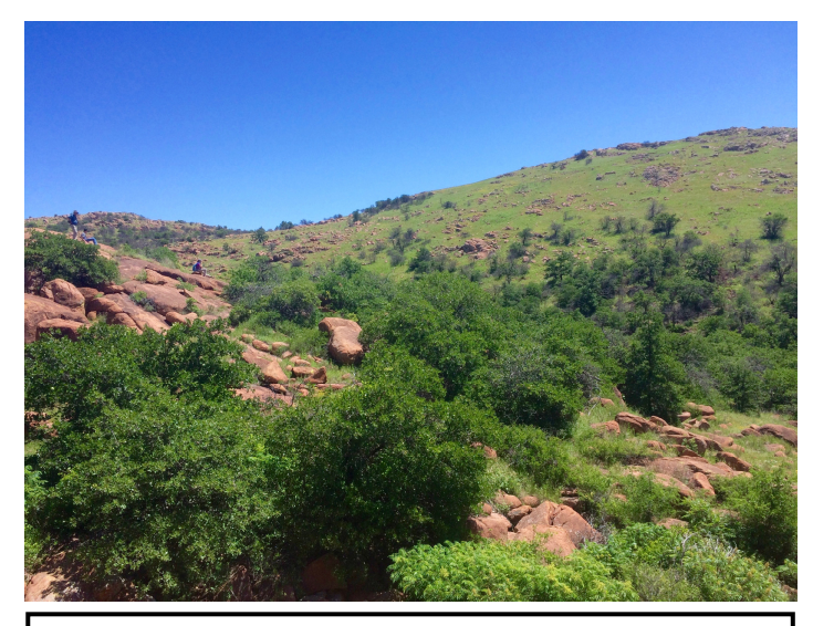
Black-capped Vireo habitat.

Other forms of wildlife were plentiful as well. We had several close encounters with western diamondback rattlesnakes, watched coyotes and young gray foxes leap through fields and canyons, and heard the mournful call of greater roadrunners every day without fail. Overall, I enjoyed spending my summer in the western part of the country constantly in the presence of a bird that I had wanted to see for so long while also obtaining experience that should prove vital in pursuing other avenues into ornithology.